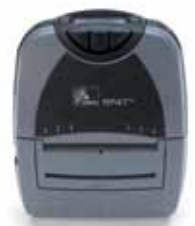
RP4T mobile printer