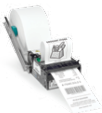
KR203™ kiosk printer