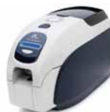
ZXP Series 3™ card printer