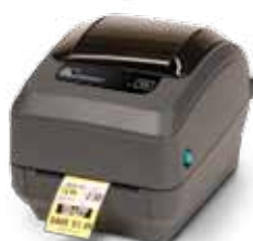
G-Series desktop printer