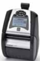
QLn mobile printer

For self-service and kiosk applications, from tickets to receipts to coupons, Zebra has a compact direct-thermal kiosk printer for the job. These kiosk printers are designed for tough, unattended printing applications, where reliability, robustness, minimal maintenance and compact size are essential.